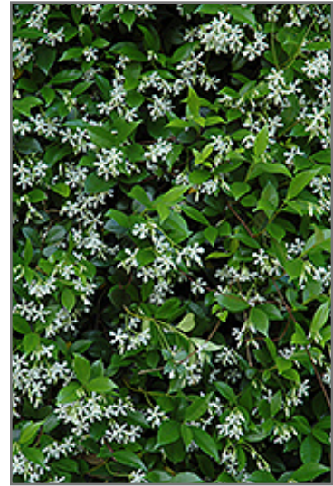
Confederate Star-Jasmine flowers