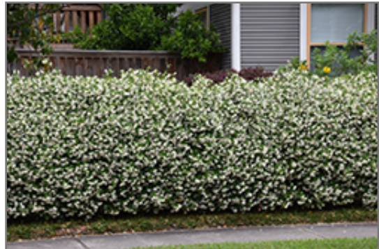
Confederate Star-Jasmine in bloom