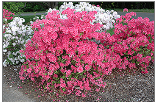
Rosy Lights Azalea in bloom