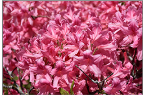
Rosy Lights Azalea flowers

Rosy Lights Azalea is recommended for the following landscape applications;