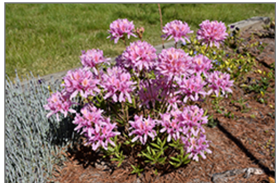
Orchid Lights Azalea in bloom