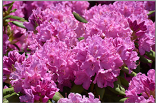
Roseum Elegans Rhododendron flowers