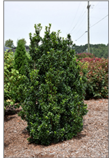
Castle Wall Meserve Holly