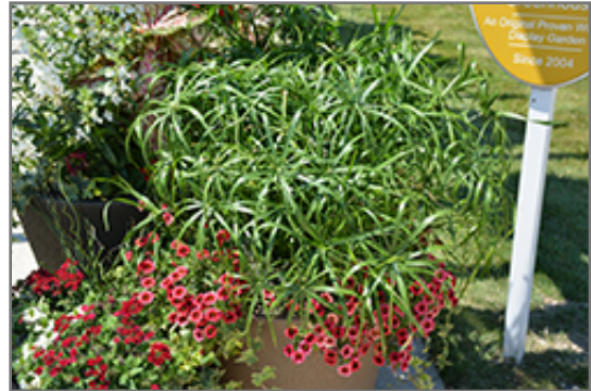
Baby Tut Umbrella Grass