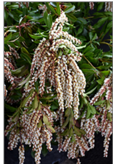
Mountain Fire Japanese Pieris flowers