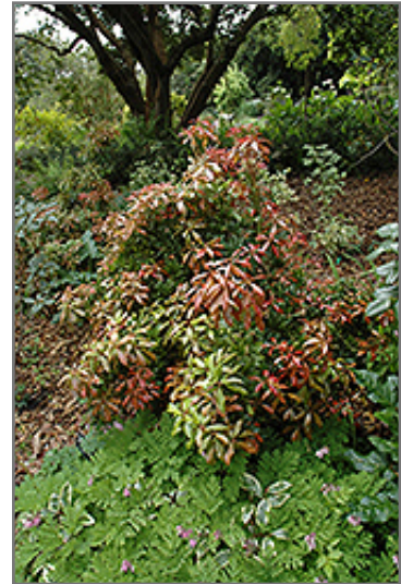
Mountain Fire Japanese Pieris

This shrub does best in full sun to partial shade. It requires an evenly moist well-drained soil for optimal growth, but will die in standing water. It is very fussy about its soil conditions and must have rich, acidic soils to ensure success, and is subject to chlorosis (yellowing) of the foliage in alkaline soils. It is somewhat tolerant of urban pollution, and will benefit from being planted in a relatively sheltered location. Consider applying a thick mulch around the root zone in winter to protect it in exposed locations or colder microclimates. This is a selected variety of a species not originally from North America, and parts of it are known to be toxic to humans and animals, so care should be exercised in planting it around children and pets.