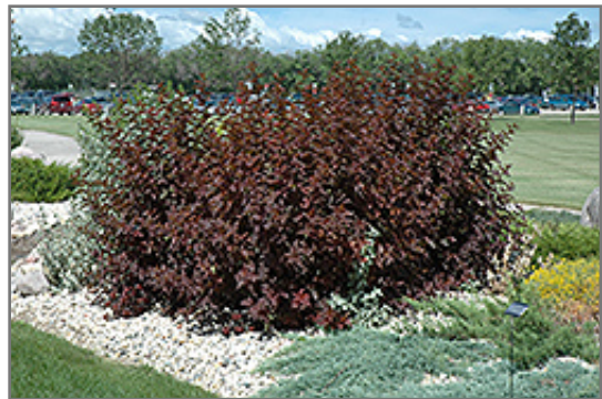
Diablo Ninebark