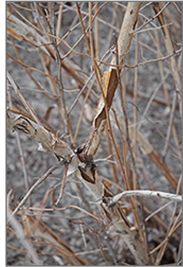
Diablo Ninebark bark

This shrub does best in full sun to partial shade. It is very adaptable to both dry and moist locations, and should do just fine under average home landscape conditions. It is not particular as to soil type or pH. It is highly tolerant of urban pollution and will even thrive in inner city environments. This is a selection of a native North American species.