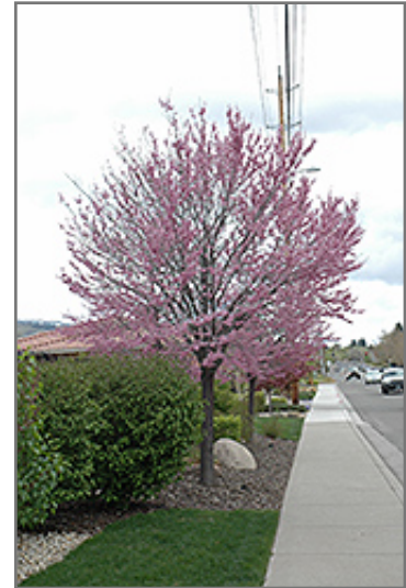
Eastern Redbud (tree form) in bloom

This tree does best in full sun to partial shade. It prefers to grow in average to moist conditions, and shouldn't be allowed to dry out. It is not particular as to soil type or pH. It is highly tolerant of urban pollution and will even thrive in inner city environments, and will benefit from being planted in a relatively sheltered location. Consider applying a thick mulch around the root zone in winter to protect it in exposed locations or colder microclimates. This is a selection of a native North American species.