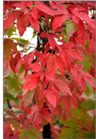
Paperbark Maple in fall

This tree does best in full sun to partial shade. It prefers to grow in average to moist conditions, and shouldn't be allowed to dry out. It is not particular as to soil type or pH. It is somewhat tolerant of urban pollution. This species is not originally from North America.