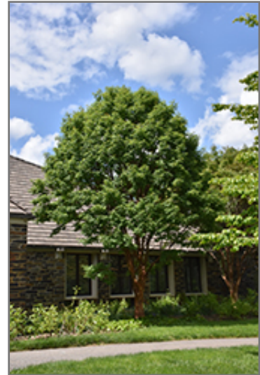
Paperbark Maple