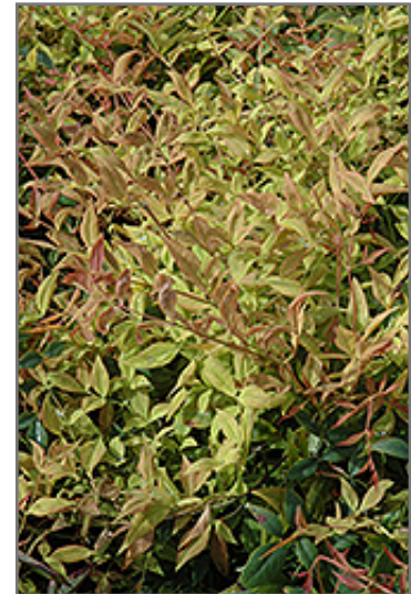
Gulf Stream Dwarf Nandina foliage