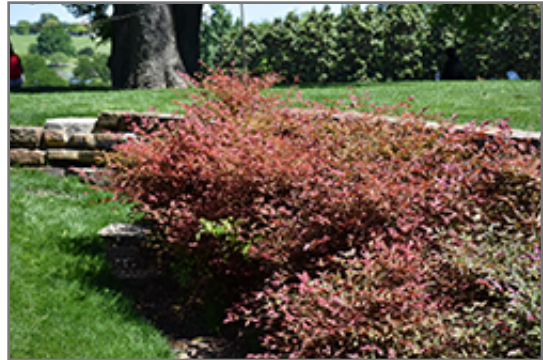
Flirt Nandina

Flirt Nandina is recommended for the following landscape applications;