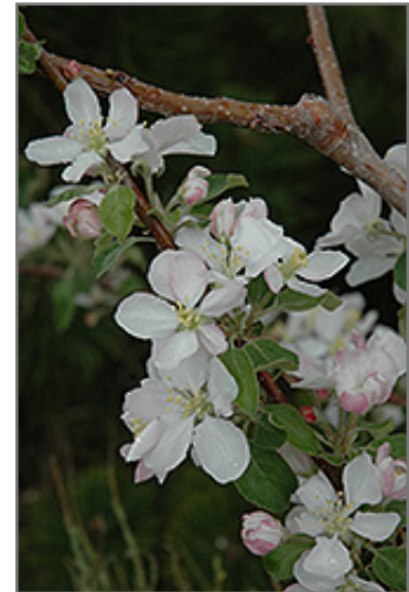
Pink Lady Apple flowers