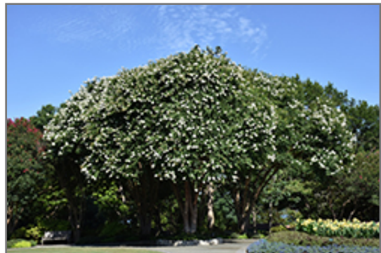
Natchez Crapemyrtle in bloom