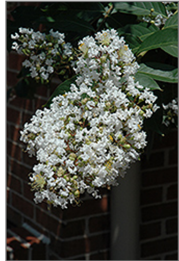
Natchez Crapemyrtle flowers

This is a relatively low maintenance tree, and is best pruned in late winter once the threat of extreme cold has passed. Deer don't particularly care for this plant and will usually leave it alone in favor of tastier treats. It has no significant negative characteristics.