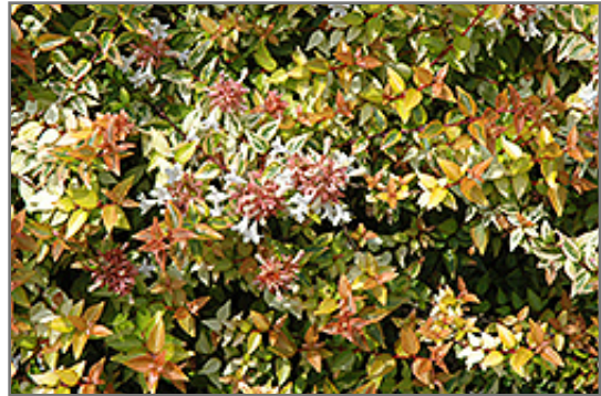
Kaleidoscope Abelia flowers

This shrub will require occasional maintenance and upkeep, and should only be pruned after flowering to avoid removing any of the current season's flowers. It is a good choice for attracting birds, bees and butterflies to your yard, but is not particularly attractive to deer who tend to leave it alone in favor of tastier treats. It has no significant negative characteristics.