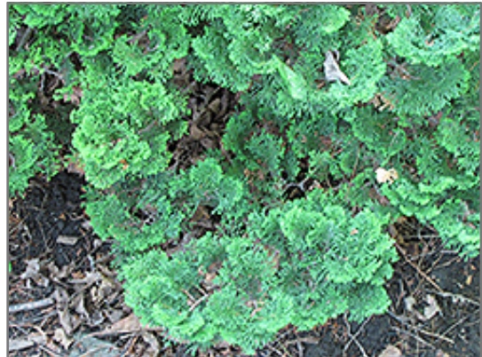
Nana Dwarf Hinoki Falsecypress foliage