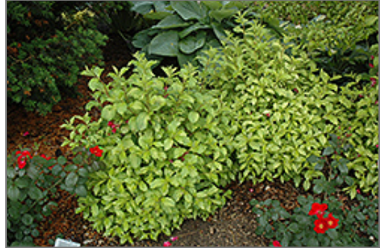
Ghost Weigela

This shrub should only be grown in full sunlight. It prefers to grow in average to moist conditions, and shouldn't be allowed to dry out. It is not particular as to soil type or pH. It is highly tolerant of urban pollution and will even thrive in inner city environments. This is a selected variety of a species not originally from North America.