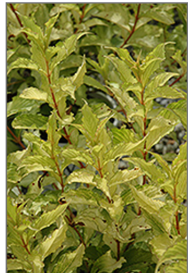
Ghost Weigela foliage