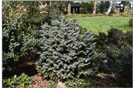
Papoose Dwarf Sitka Spruce

Papoose Dwarf Sitka Spruce is recommended for the following landscape applications;