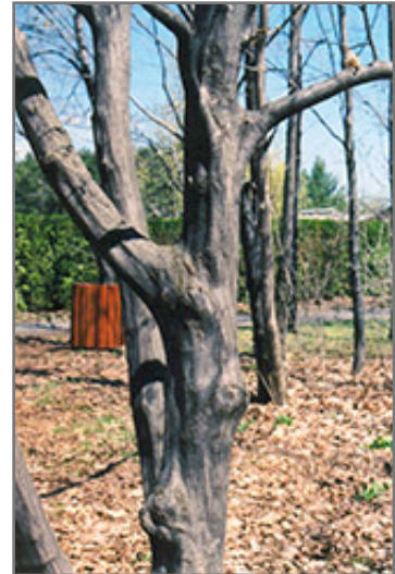
American Hornbeam bark

This tree performs well in both full sun and full shade. It is an amazingly adaptable plant, tolerating both dry conditions and even some standing water. It is not particular as to soil type or pH. It is somewhat tolerant of urban pollution. This species is native to parts of North America.