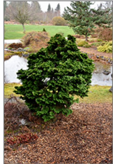
Dwarf Hinoki Falsecypress