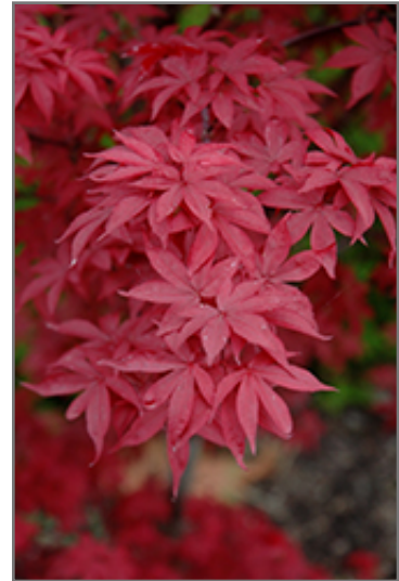
Twombly's Red Sentinel Japanese Maple foliage

Twombly's Red Sentinel Japanese Maple is recommended for the following landscape applications;