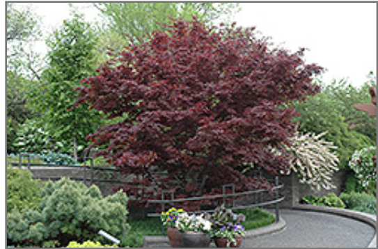
Bloodgood Japanese Maple

Bloodgood Japanese Maple is recommended for the following landscape applications;