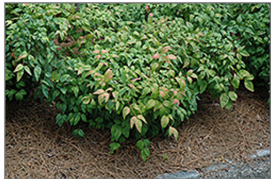
Fire Power Nandina