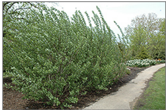
French Pussy Willow