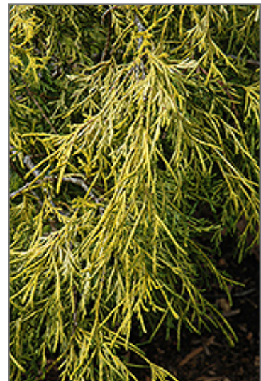
Lemon Thread Falsecypress foliage