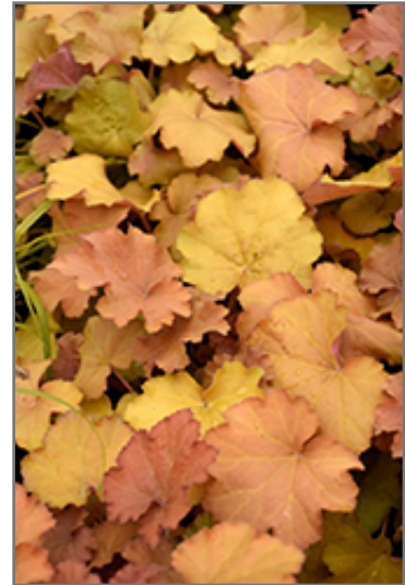
Caramel Coral Bells foliage

Caramel Coral Bells is recommended for the following landscape applications;