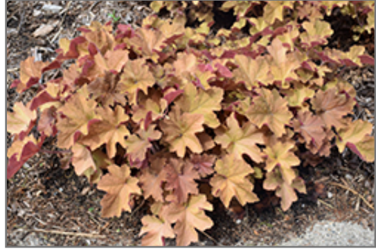
Caramel Coral Bells

Caramel Coral Bells will grow to be about 10 inches tall at maturity extending to 18 inches tall with the flowers, with a spread of 18 inches. When grown in masses or used as a bedding plant, individual plants should be spaced approximately 15 inches apart. Its foliage tends to remain low and dense right to the ground. It grows at a medium rate, and under ideal conditions can be expected to live for approximately 10 years. As an evergreen perennial, this plant will typically keep its form and foliage year-round.