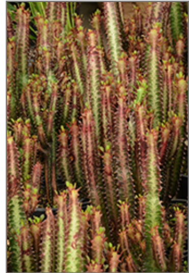
Rubra African Milk Tree stems

When grown indoors, Rubra African Milk Tree can be expected to grow to be about 9 feet tall at maturity, with a spread of 4 feet. It grows at a medium rate, and under ideal conditions can be expected to live for approximately 60 years. This houseplant will do well in a location that gets either direct or indirect sunlight, although it will usually require a more brightly-lit environment than what artificial indoor lighting alone can provide. It does best in average soil that is neither too wet nor too dry, and may die if left in standing water for any length of time. This plant should be watered when the surface of the soil gets dry, and will need watering approximately once each week. Be aware that your particular watering schedule may vary depending on its location in the room, the pot size, plant size and other conditions; if in doubt, ask one of our experts in the store for advice. Like most succulents and cacti, it prefers to grow in poor soils and should therefore never be fertilized. It is not particular as to soil pH, but grows best in sandy soil. Contact the store for specific recommendations on pre-mixed potting soil for this plant. Be warned that parts of this plant are known to be toxic to humans and animals, so special care should be exercised if growing it around children and pets.