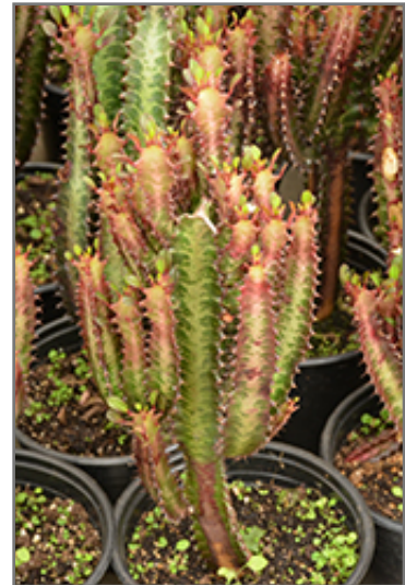
Rubra African Milk Tree in full