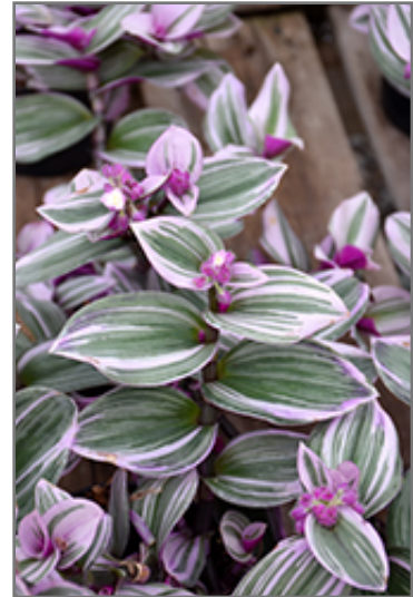
Nanouk Tradescantia foliage

This is an herbaceous evergreen houseplant with a spreading, ground-hugging habit of growth. Its relatively fine texture sets it apart from other indoor plants with less refined foliage. This plant may benefit from an occasional pruning to look its best.