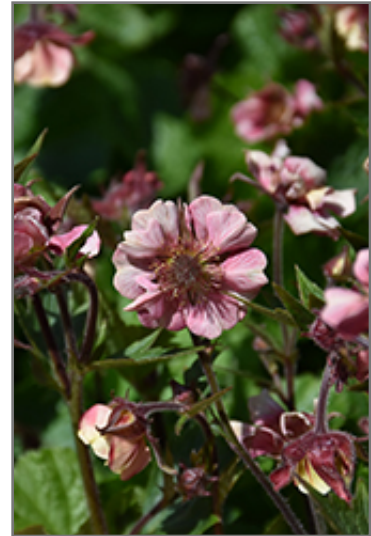
Tempo Rose Avens flowers

Tempo Rose Avens is recommended for the following landscape applications;