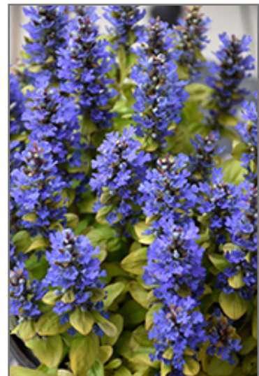
Feathered Friends Petite Parakeet Bugleweed flowers