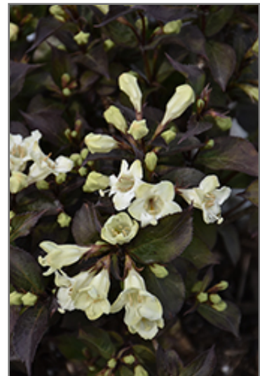
Wine & Spirits Weigela flowers