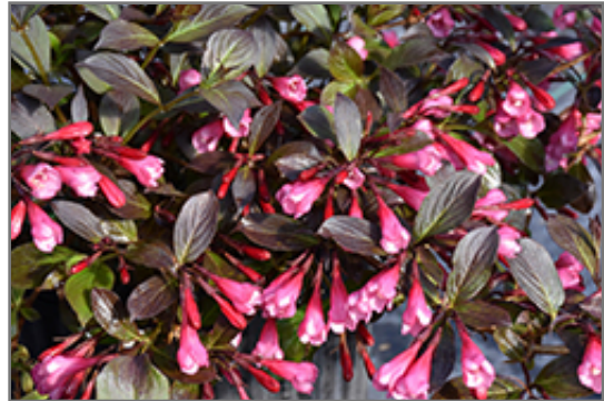
Very Fine Wine Weigela flowers

Very Fine Wine Weigela is recommended for the following landscape applications;