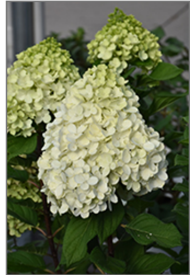
Little Lime Punch Hydrangea flowers

Little Lime Punch Hydrangea is recommended for the following landscape applications;