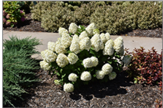
Little Lime Punch Hydrangea in bloom

Little Lime Punch Hydrangea makes a fine choice for the outdoor landscape, but it is also well-suited for use in outdoor pots and containers. With its upright habit of growth, it is best suited for use as a 'thriller' in the 'spiller-thriller-filler' container combination; plant it near the center of the pot, surrounded by smaller plants and those that spill over the edges. It is even sizeable enough that it can be grown alone in a suitable container. Note that when grown in a container, it may not perform exactly as indicated on the tag - this is to be expected. Also note that when growing plants in outdoor containers and baskets, they may require more frequent waterings than they would in the yard or garden.