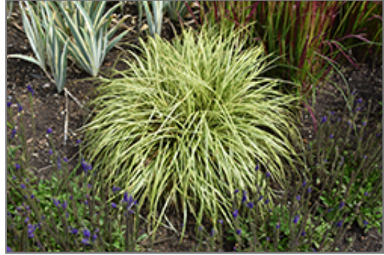
Evergold Variegated Japanese Sedge foliage

Evergold Variegated Japanese Sedge will grow to be about 8 inches tall at maturity, with a spread of 12 inches. Its foliage tends to remain low and dense right to the ground. It grows at a medium rate, and under ideal conditions can be expected to live for approximately 10 years. As an evergreen perennial, this plant will typically keep its form and foliage year-round.