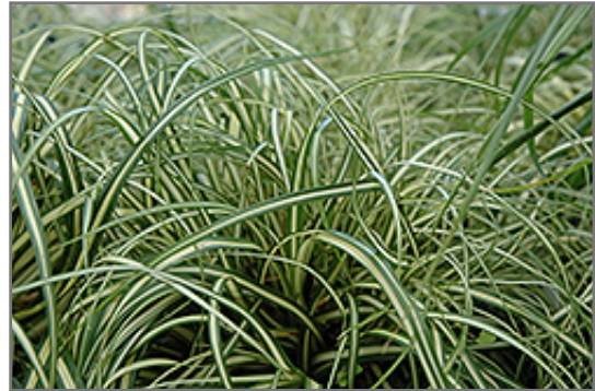
Evergold Variegated Japanese Sedge foliage

Evergold Variegated Japanese Sedge is recommended for the following landscape applications;