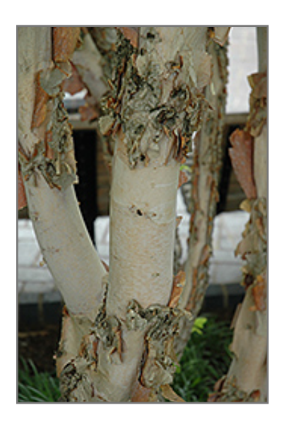
Fox Valley River Birch bark

Fox Valley River Birch is recommended for the following landscape applications;