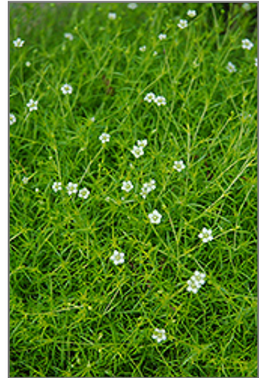
Scotch Moss flowers