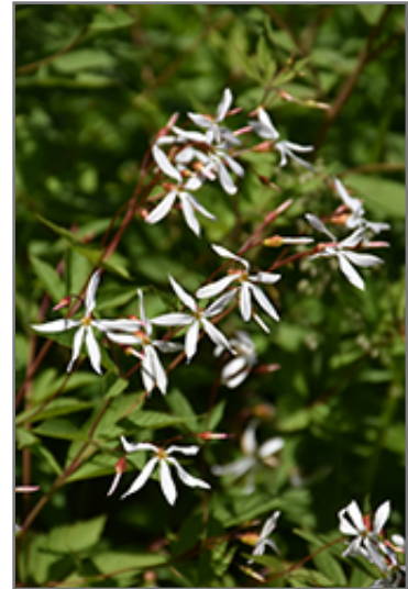
Bowman's Root flowers

This plant will require occasional maintenance and upkeep, and should be cut back in late fall in preparation for winter. It is a good choice for attracting bees and butterflies to your yard. It has no significant negative characteristics.