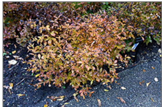
Bowman's Root in fall