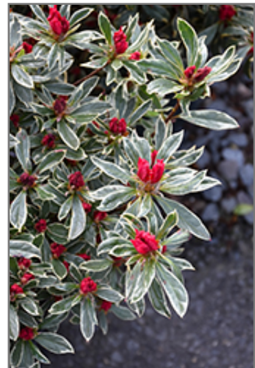
Silver Sword Azalea foliage