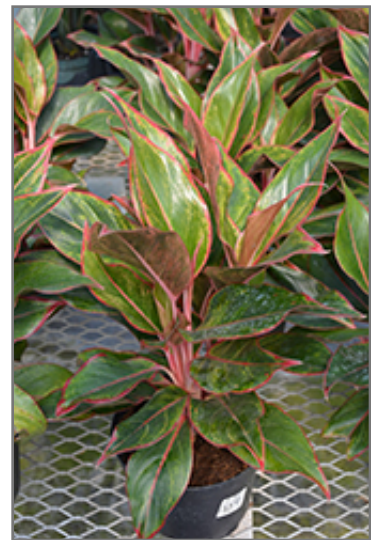
Siam Aurora Chinese Evergreen in full