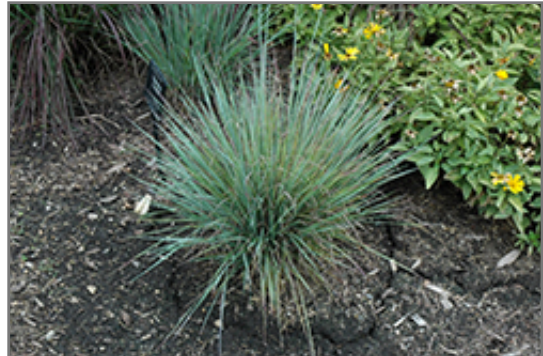
Standing Ovation Bluestem