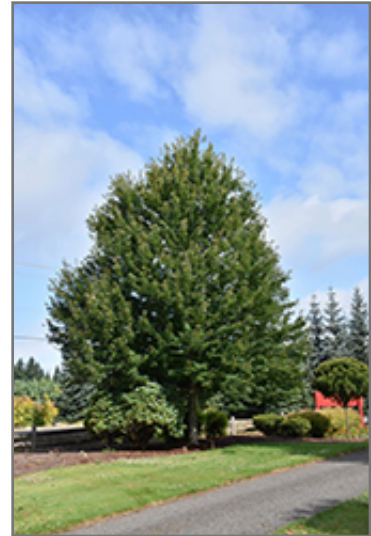
Redpointe Red Maple