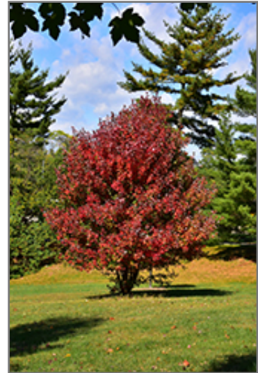
Redpointe Red Maple in fall

This tree should only be grown in full sunlight. It is quite adaptable, preferring to grow in average to wet conditions, and will even tolerate some standing water. It is not particular as to soil type, but has a definite preference for acidic soils, and is subject to chlorosis (yellowing) of the foliage in alkaline soils. It is somewhat tolerant of urban pollution. This is a selection of a native North American species.