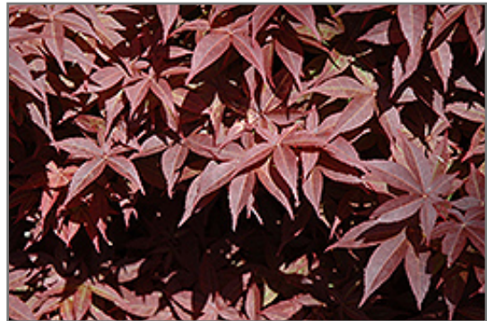
Rhode Island Red Japanese Maple foliage