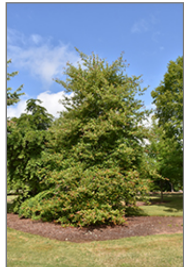
Wildfire Black Gum