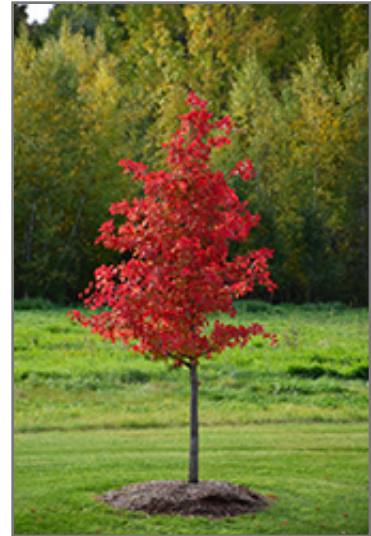
Wildfire Black Gum in fall