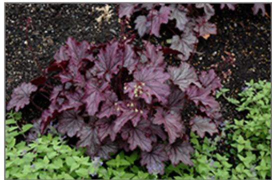
Spellbound Coral Bells