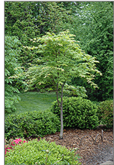
Osakazuki Japanese Maple