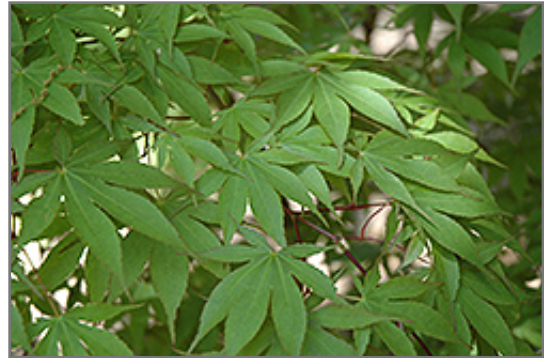
Osakazuki Japanese Maple foliage

This is a relatively low maintenance tree, and should only be pruned in summer after the leaves have fully developed, as it may 'bleed' sap if pruned in late winter or early spring. It has no significant negative characteristics.