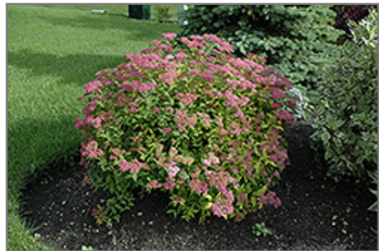
Goldflame Spirea in bloom