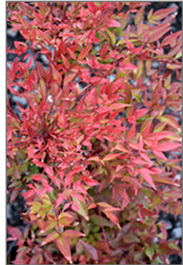
Obsession Nandina foliage