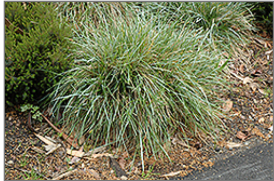
Blue Moor Grass