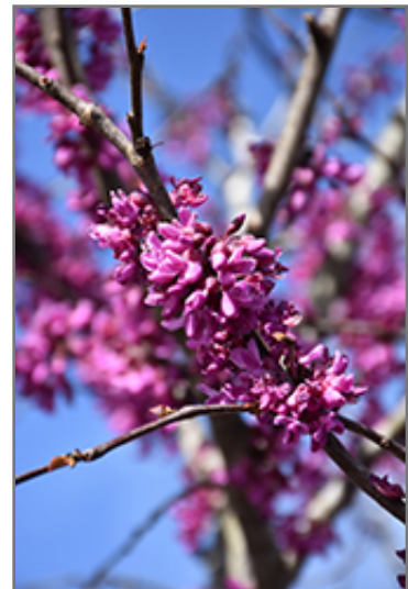
Eastern Redbud (tree form) flowers